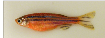
Orange fish Glo REP /Glo - ; Glo YFP /Glo -