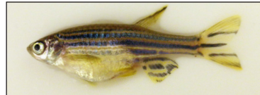
Grey fish Glo - /Glo - ; Glo - /Glo -