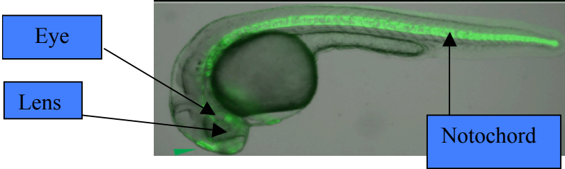
Figure 3: Bright field and fluorescent picture overlaid to show the information from both Figure 1 and Figure 2.