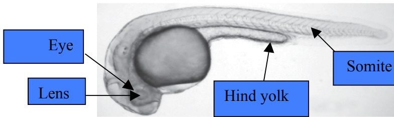
Figure 1: Normal one day old zebrafish embryo shown in a side view with anterior to the left. Image made using brightfield microscopy